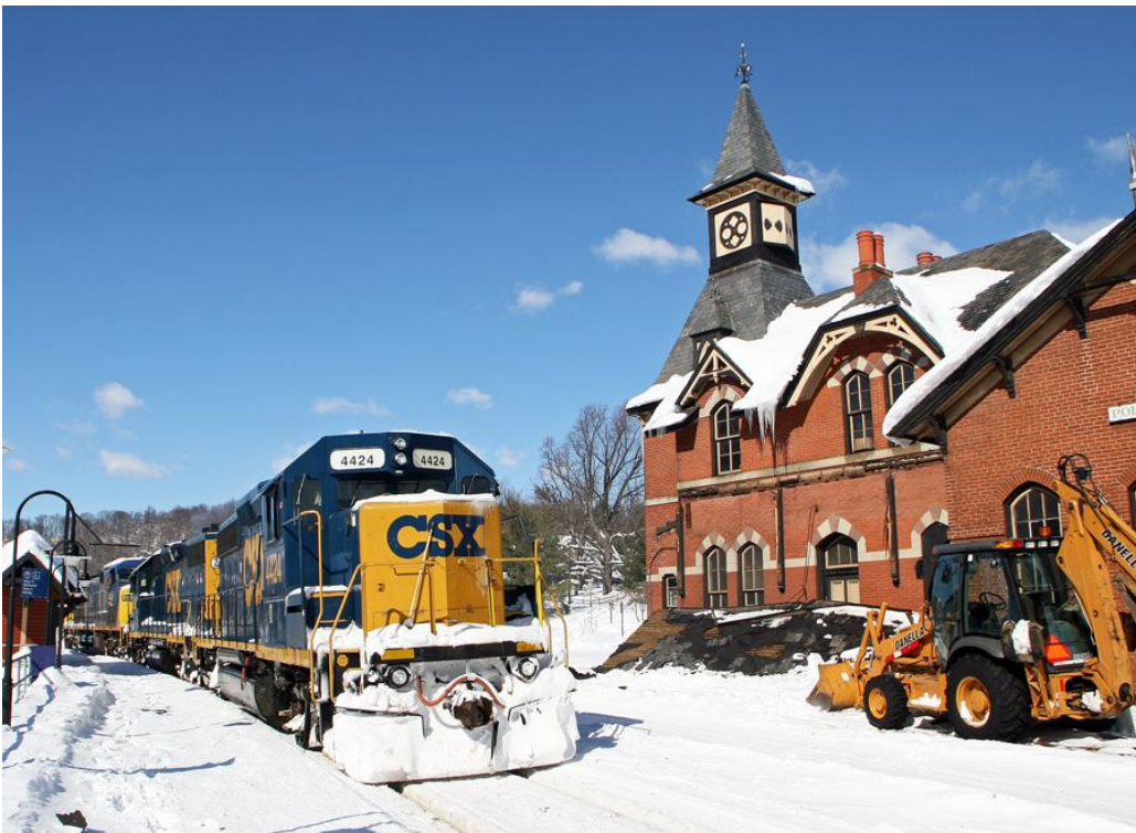
Snow and wind Damage Four-unit diesel set running as a plow extra passing by the historic ex-B&O station at Point of Rocks, MD on February 11th. On the lead is ex-Conrail GP40-2 No. 3339, now CSX No. 4424 and repainted into CSX colors. Note collapsed station canopy.