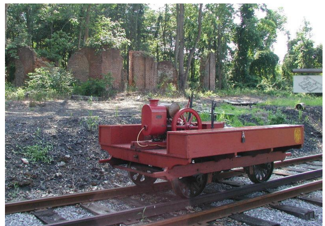
The "Flying Devil" EBY Speeder - one of 9. http://www.ebtrr.com

Option 3 - Trolley, shop tour, (maybe a speeder) and a train ride - arrive in time to be at the trolley station at 10:45 am