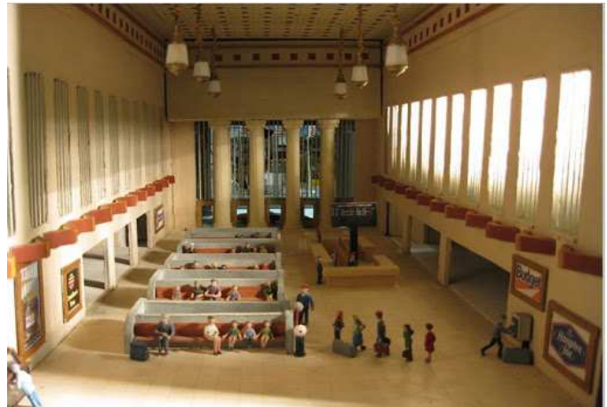
Inside the station's waiting room