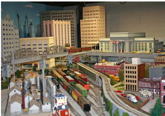
Philadelphia The two truss bridges carry PW suburban line into the upper level of the 30 th Street Station