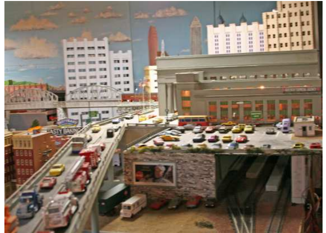
Thirtieth Street with the Penn Western tracks below