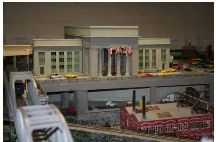
Roy Hoffman's Philadelphia 30 th Street Station