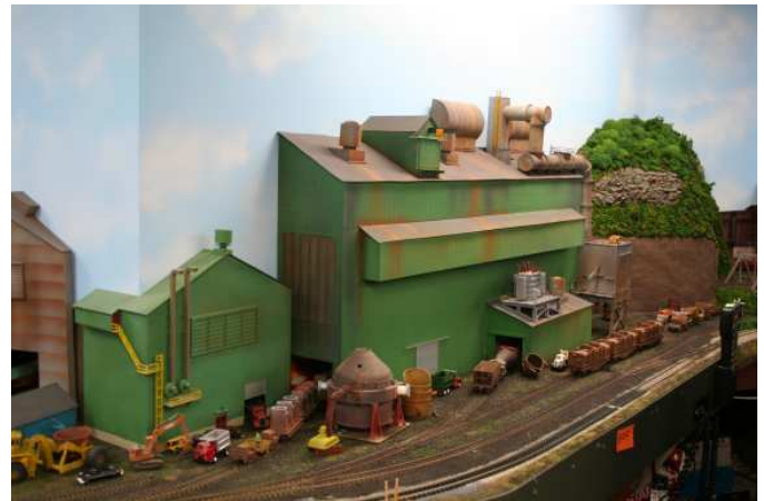
Dave Moltrup's basic oxygen furnace