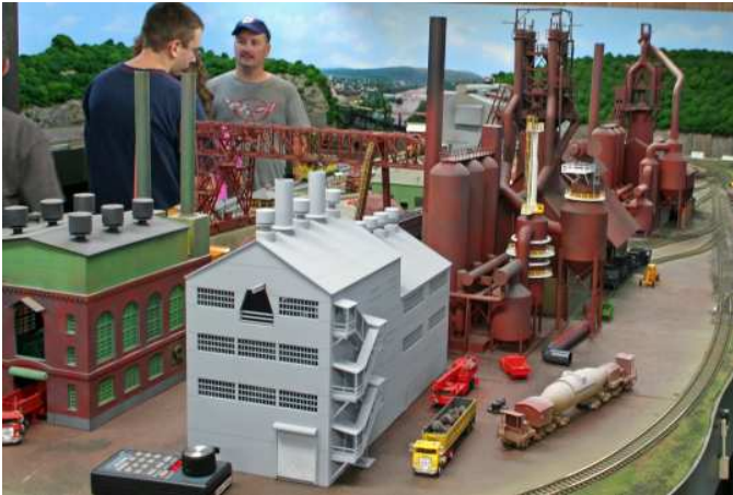
Blower buildings with stockpile and furnaces behind