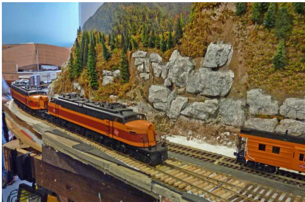
O-Scale Little Joes perform on Rich Randall's Milwaukee Road, Avery Division