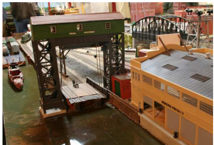
Pier head house and float bridge on the Delaware River