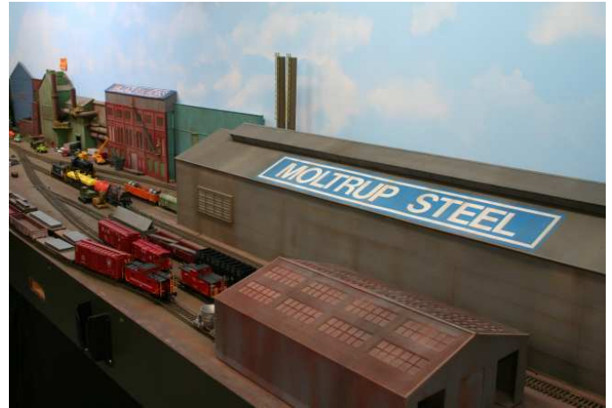
A rolling mill