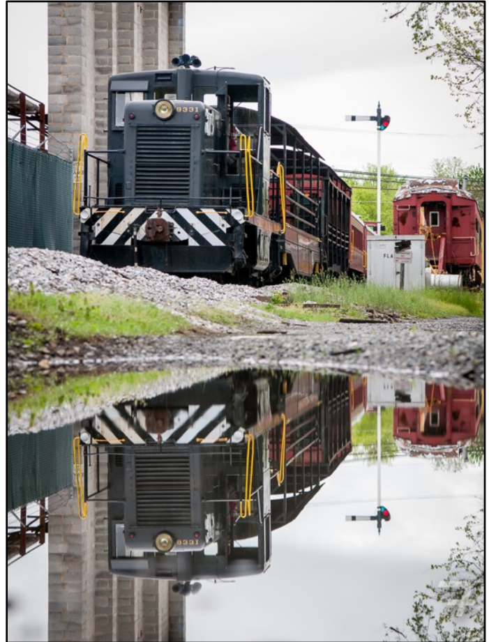
Walkersville Southern Railroad operates multiple runs on weekends through October. Santa Claus trains begin the last weekend of November and run through December 18th.