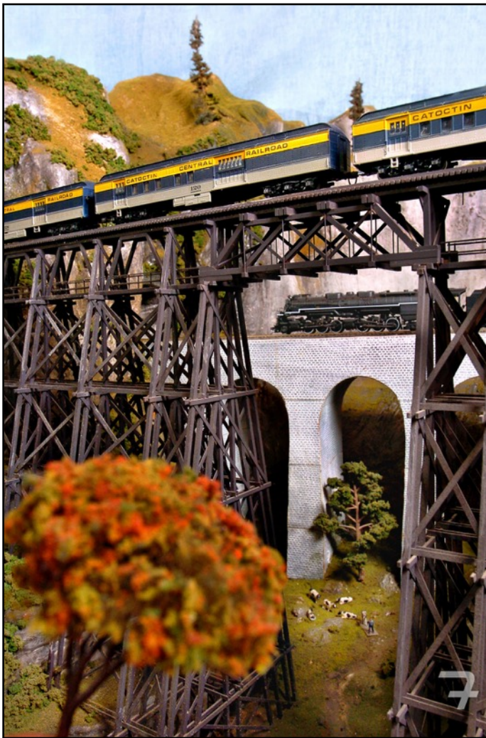
Frederick County Society of Model Engineers club layout opens for Mainline Hobby Supply layout tours, Sept. 18th.